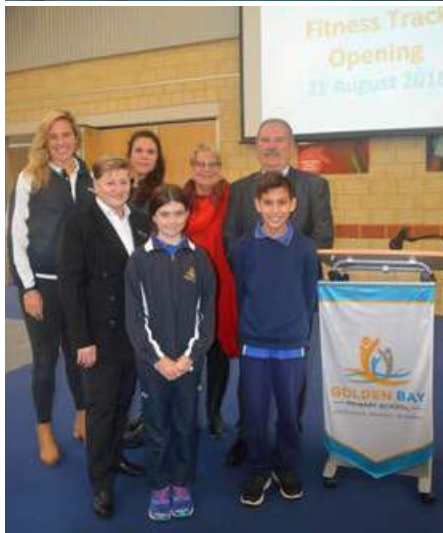
The official opening of the fitness equipment at Golden Bay Primary School.