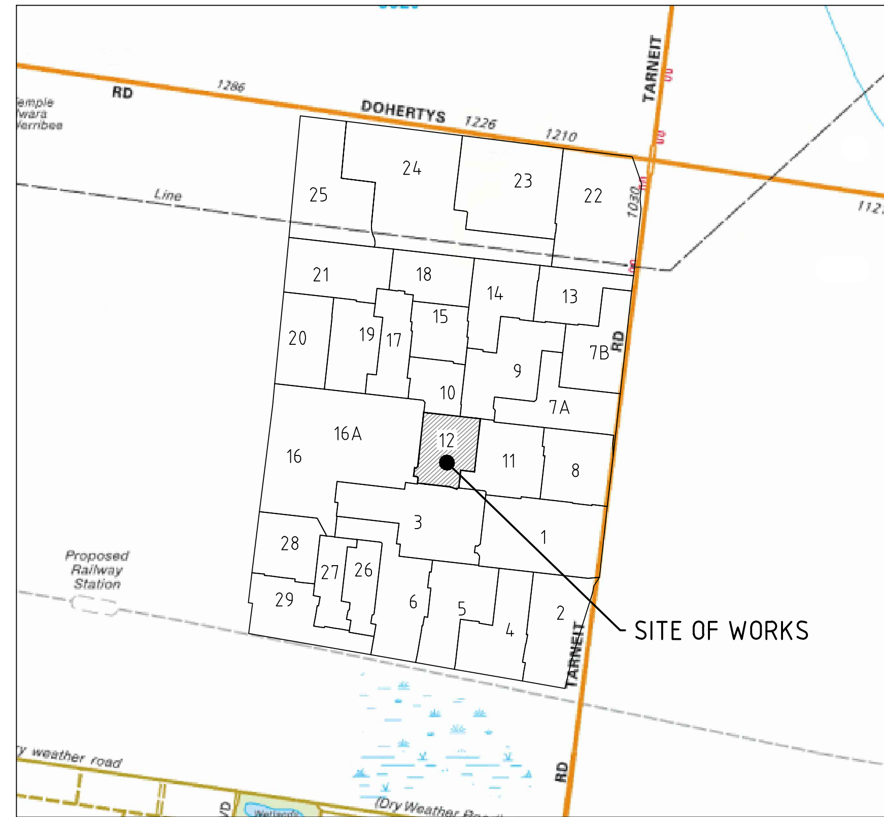
COPYRIGHT MELWAY PUBLISHING PTY LTD REPRODUCED WITH PERMISSION LOCALITY PLAN SCALE: NOT TO SCALE MELWAY: 359 B10