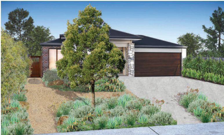
Artist impression only. Bermuda by Porter Davis.

A range of evergreen plants that colour and flower all year round and bring seasonal foliage, while symmetrical plantings reflect a more formal garden style.