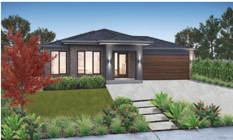
Artist impression only. Lamont by Porter Davis.

Native plants and trees provide an evergreen frame for your new home while flowering plants add a splash of seasonal colour to your front yard.