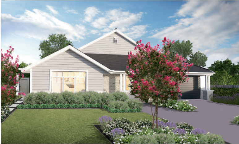
Artist impression only. Vancouver by Porter Davis.

There are three contemporary garden designs for you to choose from. Each has been created with the goal of enhancing both your home and the surrounding environment.