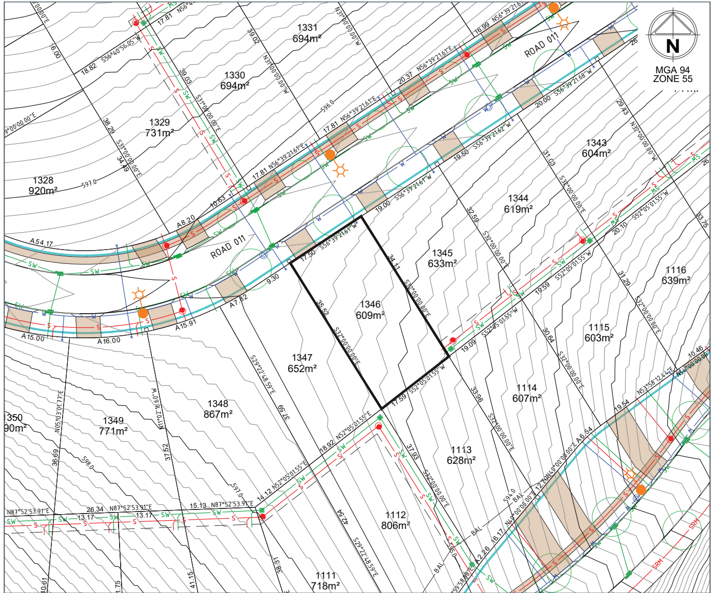
LOT LAYOUT - SCALE 1:400 (A4) REVISION --- DATE