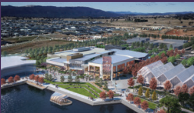
Googong Town Centre artist's impression.

Council approved the Structure Plan for the Googong Town Centre in May 2023, and we anticipate DA approval for the first Stage of the Town Centre in August 2023. This will be a major milestone and we hope to be able to announce a more specific program for Stage 1 of the Town Centre in the next few months.