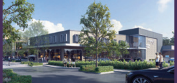
Googong Town Centre artist's impression.

We understand Council is well advanced on the assessment of the DA for the Pub and the Stevens Group will be lodging their DA for the fast-food outlets, petrol station and childcare centre in the next couple of months.