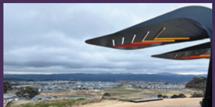
The view from the new Nangi Pimble lookout.

The lookout structures atop Nangi Pimble Reserve have been completed with only the integrated seating to be complete. The view is spectacular from the lookout, particularly on these cold misty mornings! The reserve has been revegetated over the last 5 years with trees that are the main food source of the vulnerable Glossy Black Cockatoo, and the lookout shelter design is inspired as such. In addition to the Nangi Pimble Reserve, construction is well underway on the 3rd dog park. This dog park has been split into 2 sections to separate bigger dogs from smaller dogs and both sections will include an array of dog play equipment. It is planned to be open to the public by the end of Spring 2023.