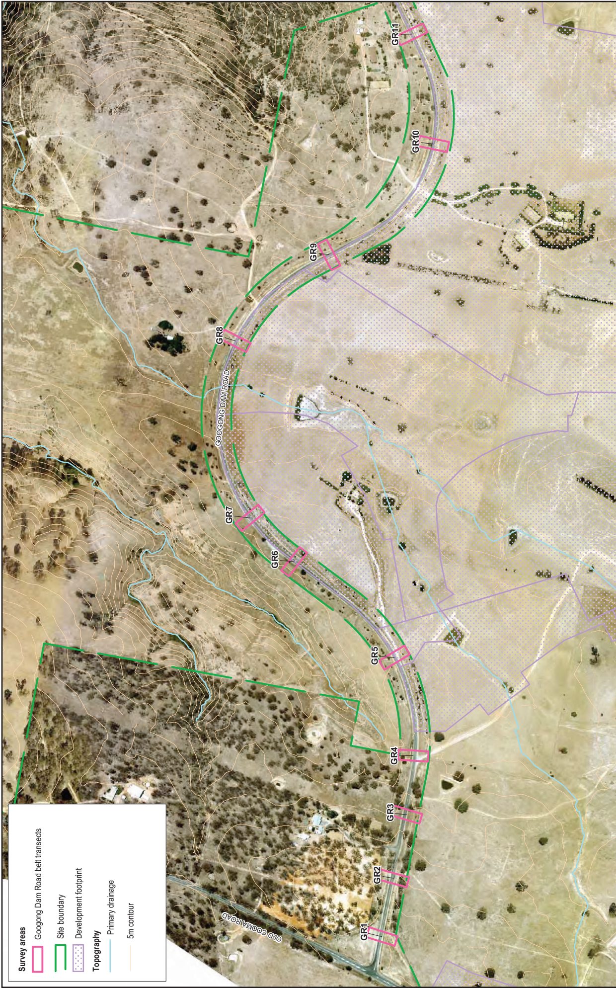
Figure 6: Flora survey transects - Googong Road Dam