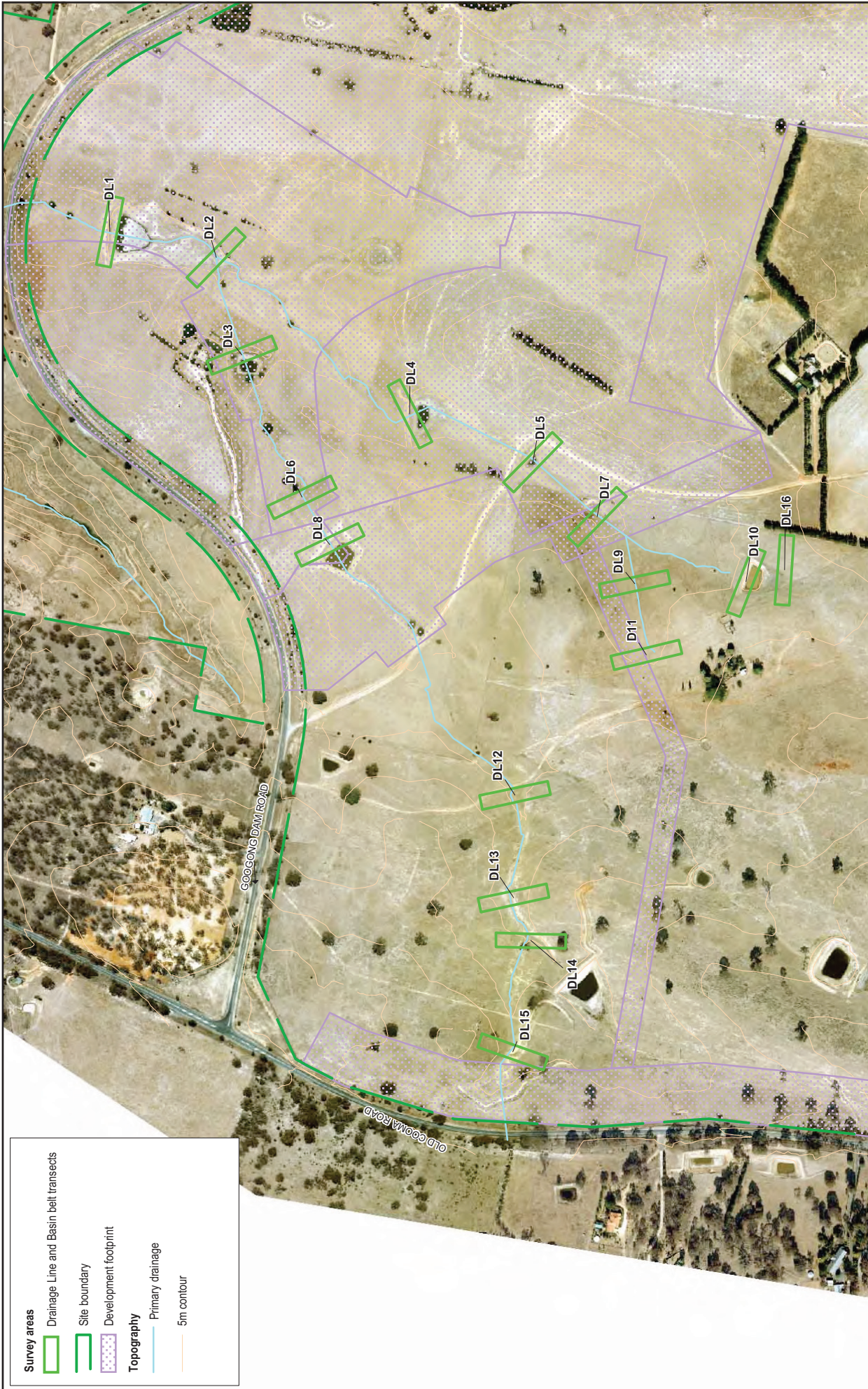
Figure 4: Flora survey transects - Drainage lines and Drainage basins