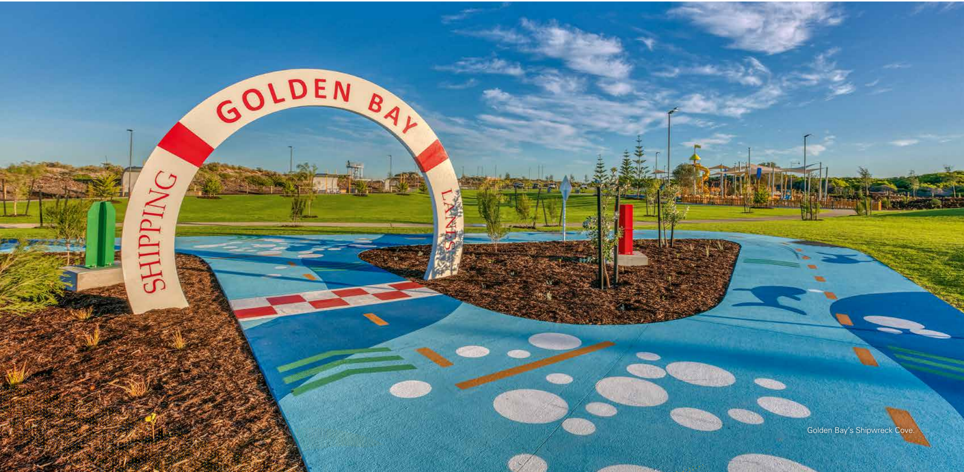
Golden Bay's Shipwreck Cove.