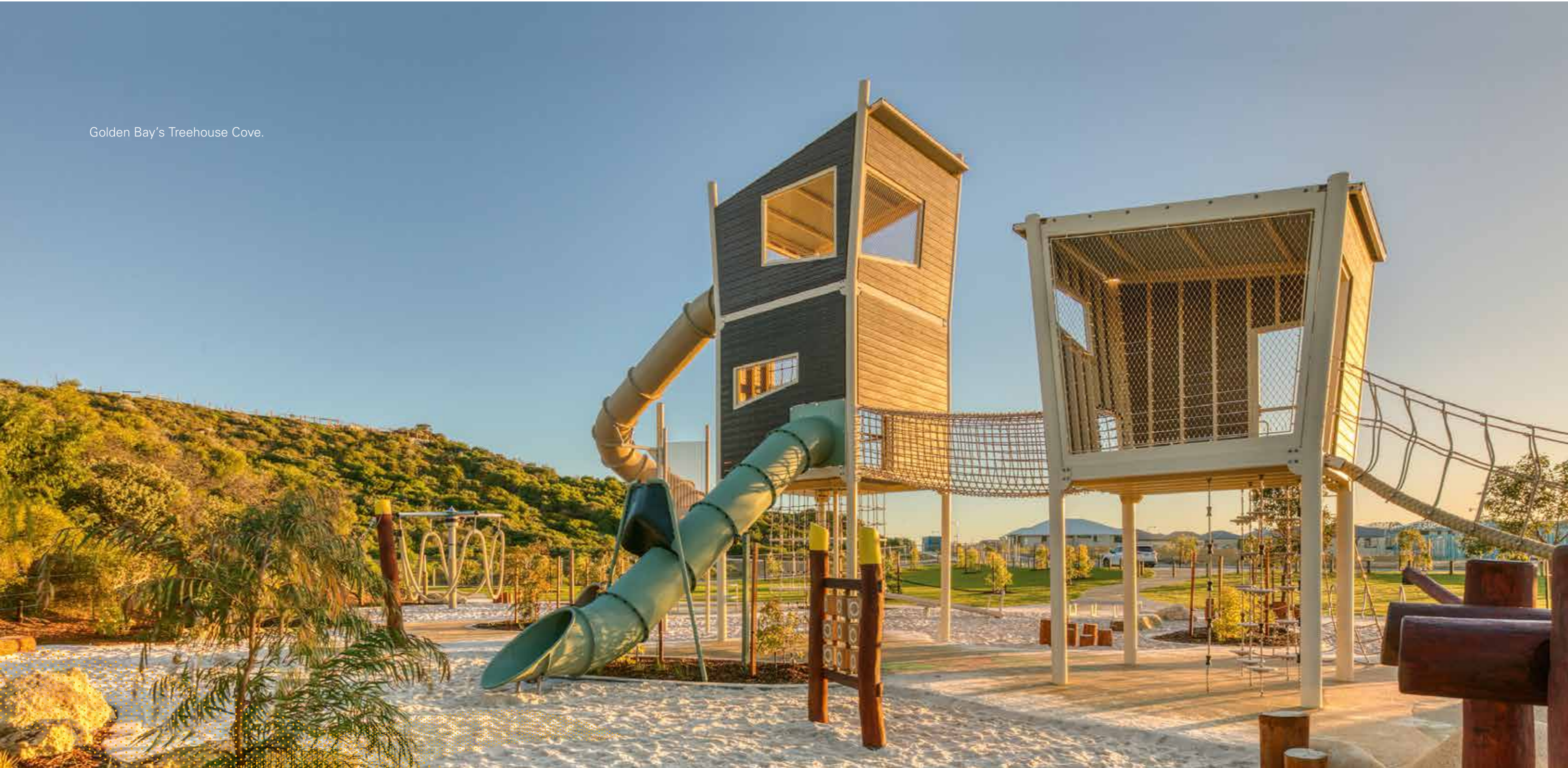
Golden Bay's Treehouse Cove.