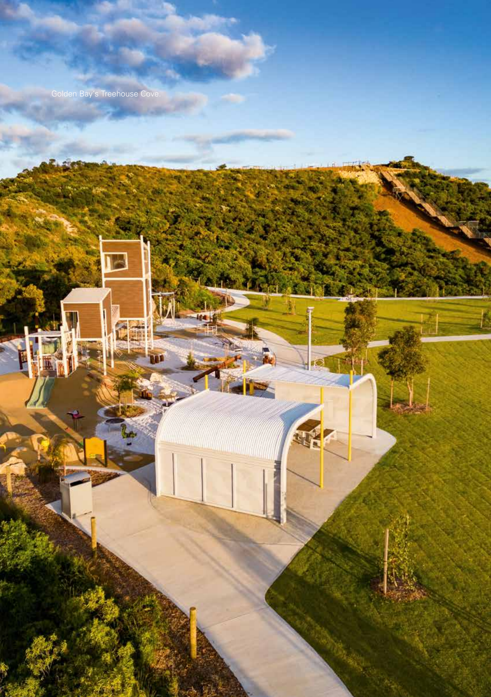
Golden Bay's Treehouse Cove.