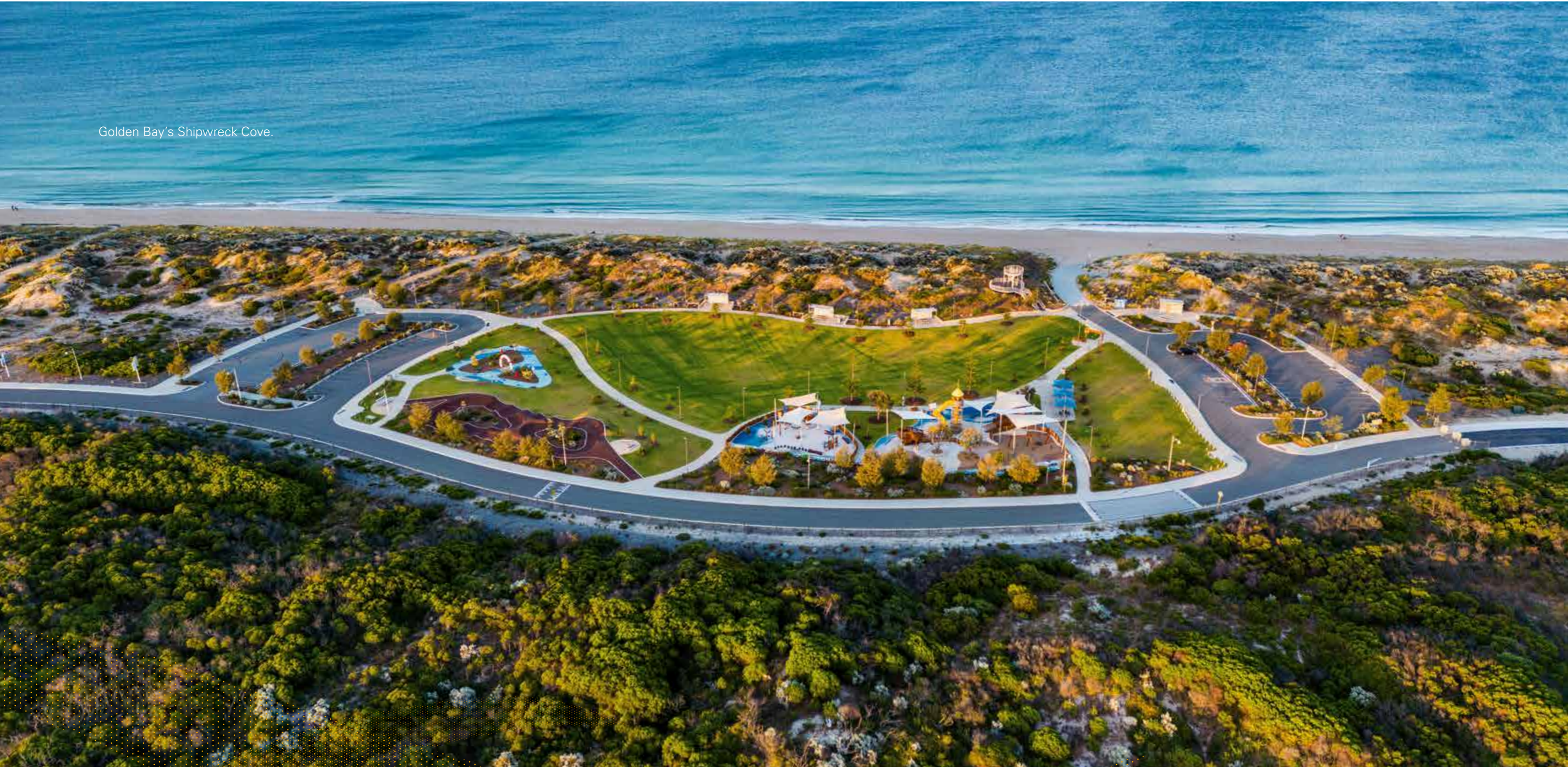
Golden Bay's Shipwreck Cove.