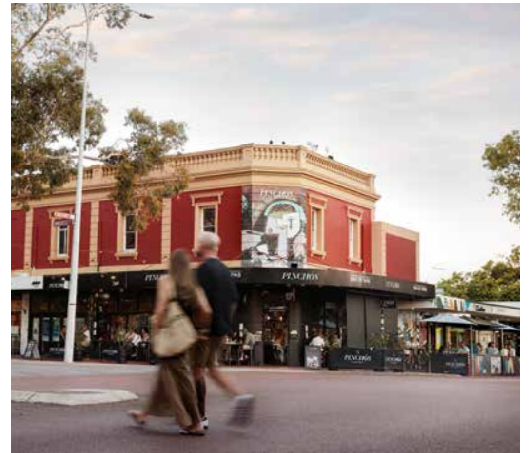
PINCHOS BAR DE TAPAS. Oxford Street, Leederville WA 6014 - 3.5KM