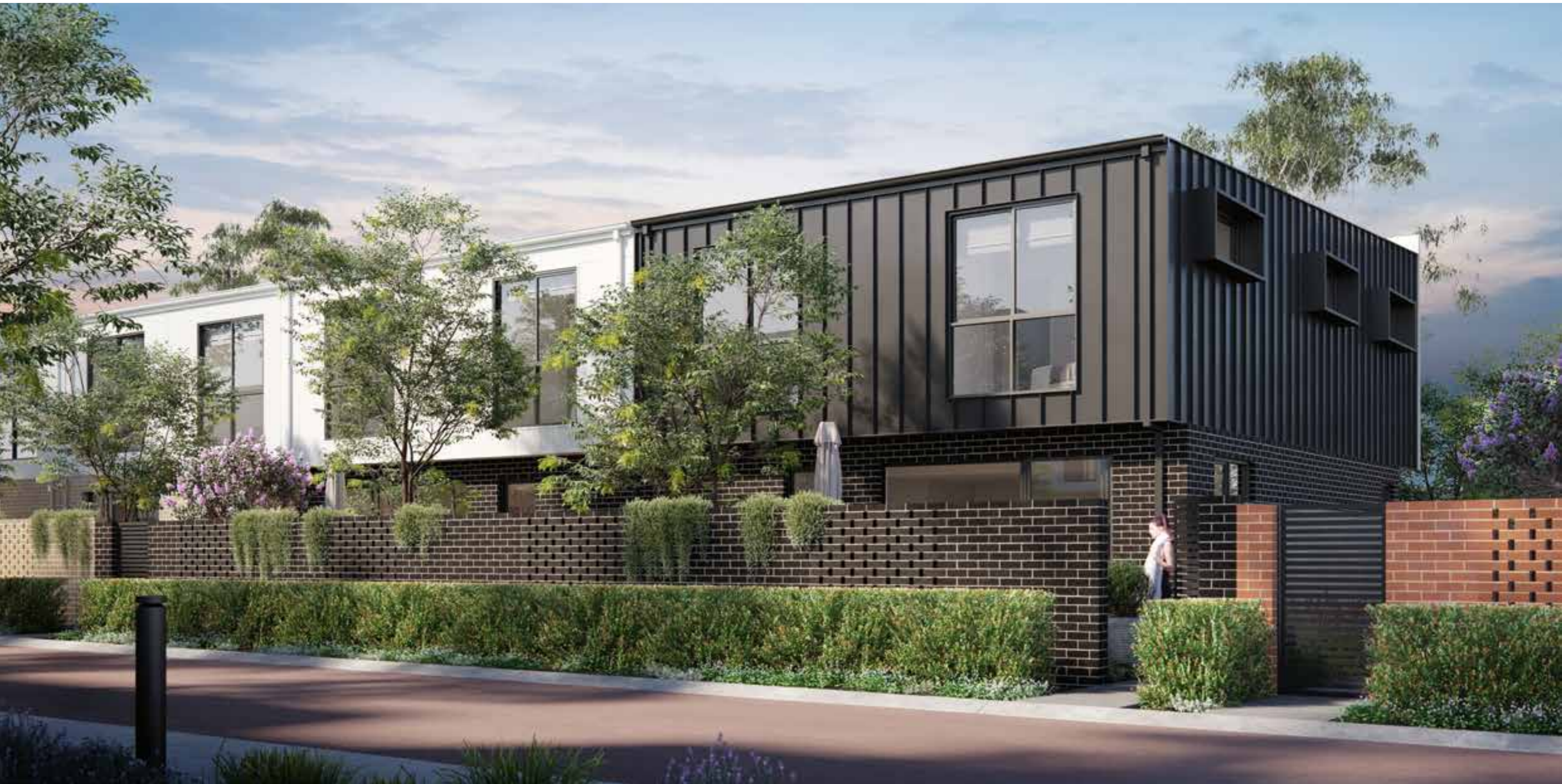
ARTIST IMPRESSION. LOT 94-100 STREETSCAPE – CENTRAL TOWNHOUSE BRICK COURTYARD WALLS