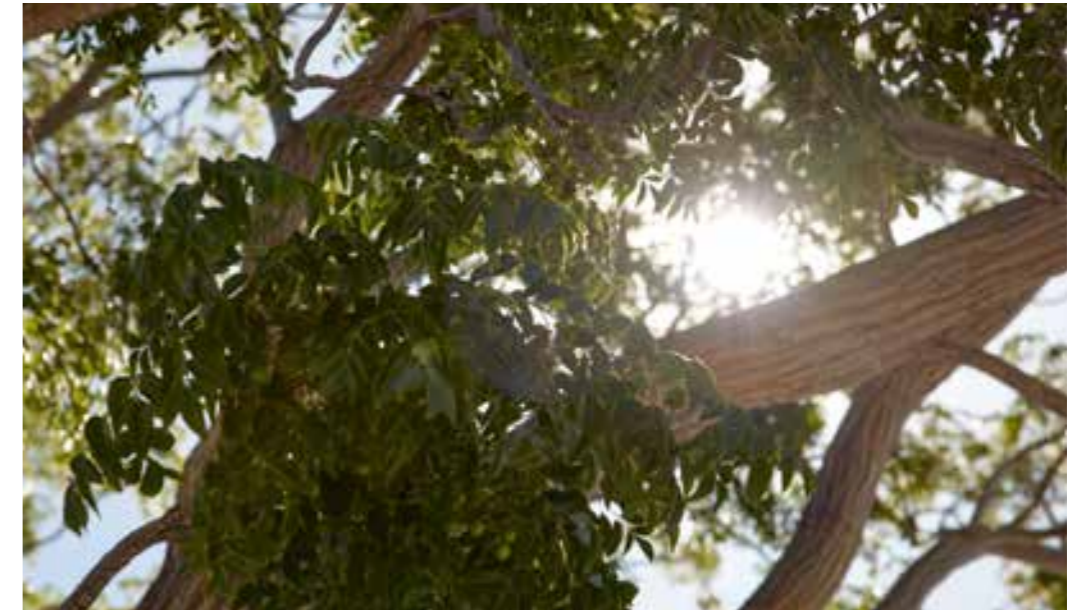
UPLIT ENTRY TREE. Glendalough Green 6016

HERDSMAN LAKE IS HOME TO SOME OF THE MOST VARIED AND EASILY OBSERVED WATERBIRDS OF ANY LAKE IN SOUTHWESTERN AUSTRALIA.