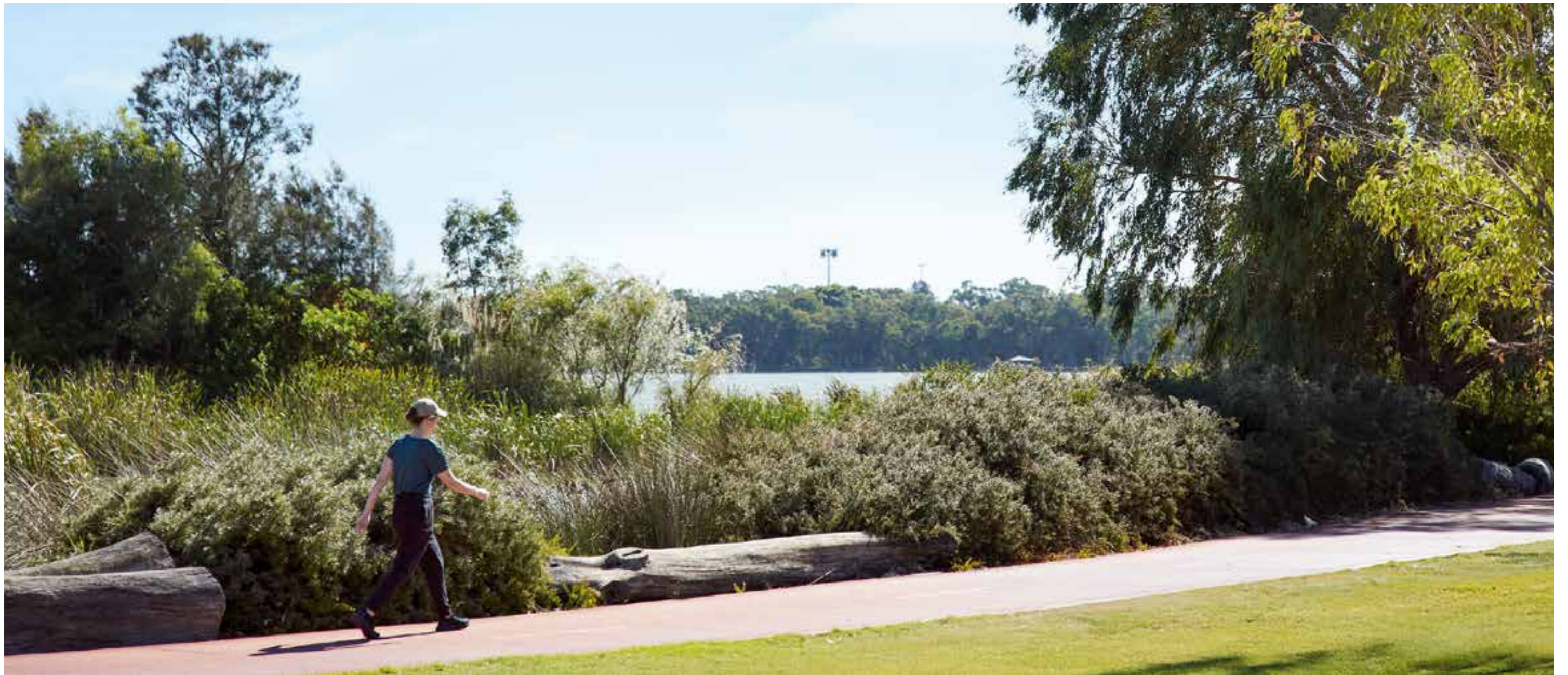
LAKE MONGER. Dodd St, Wembley WA 6014 - 900M