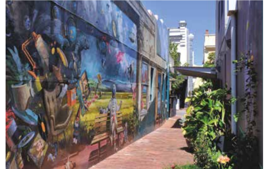
WALMSLEY LANE. Subiaco WA 6008 - 3.7KM

...WHERE EVERY STREET CORNER SINGS A DIFFERENT TUNE.