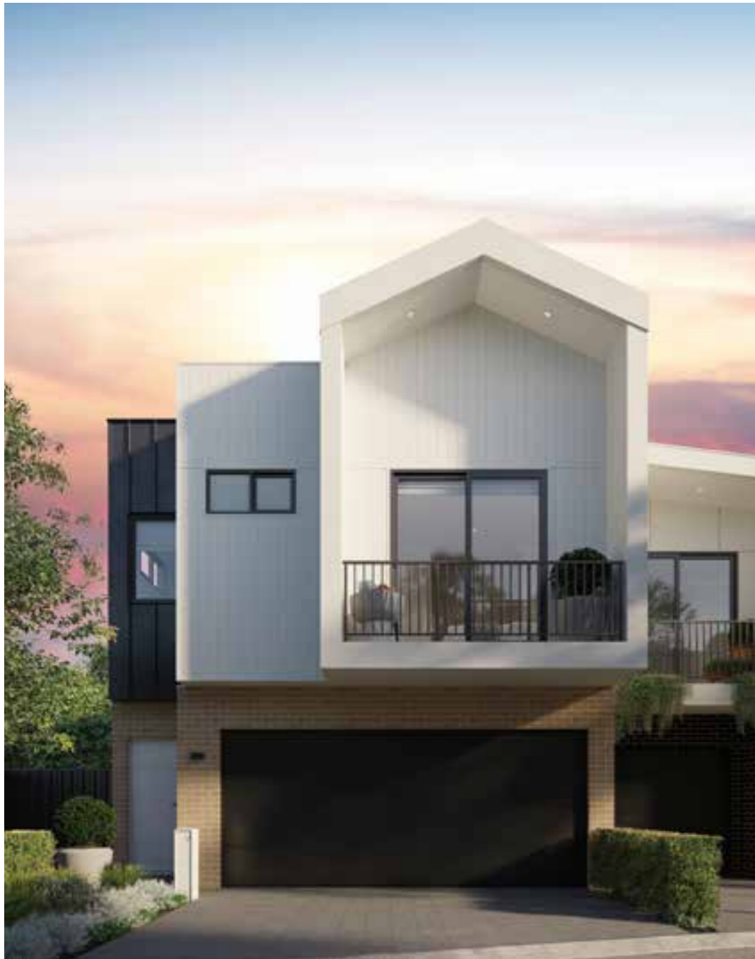
ARTIST IMPRESSION. LOT 33