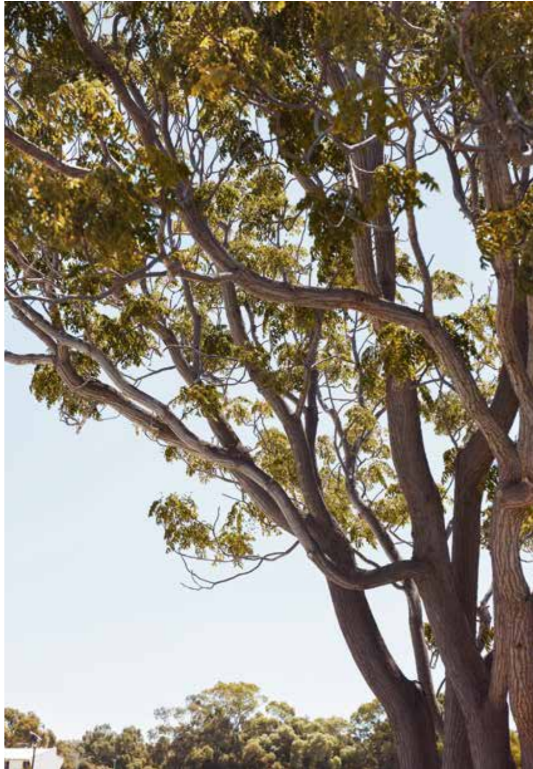
UPLIT TREE AT ENTRY. Glendalough Green 6016

GLENDALOUGH GREEN. REFINED, INNER-URBAN LIVING ON THE EDGE OF NATURE, AND THE EDGE OF CONVENIENCE.