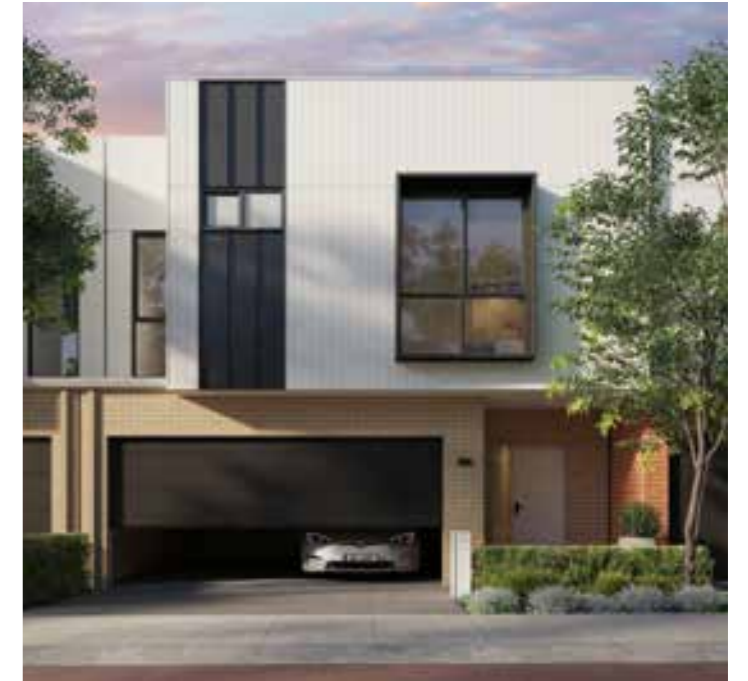
ARTIST IMPRESSION. LOT 95