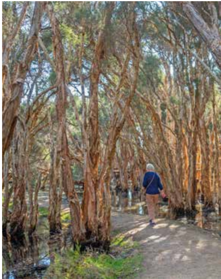
Herdsmen Lake. Jon Sanders Dr, Herdsmen WA 6017 - 250M

GLENDALOUGH GREEN MAY BE CLOSE TO URBAN CONVENIENCE, BUT IT'S ALSO VERY CLOSE TO NATURE.