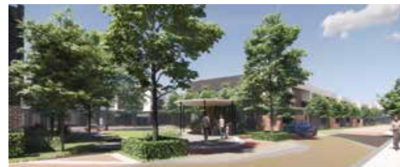
ARTIST IMPRESSION. CENTRAL OPEN SPACE

gardens will include a variety of trees, shady open grassed areas, a citrus garden and waterwise native plantings that will attract local birdlife.