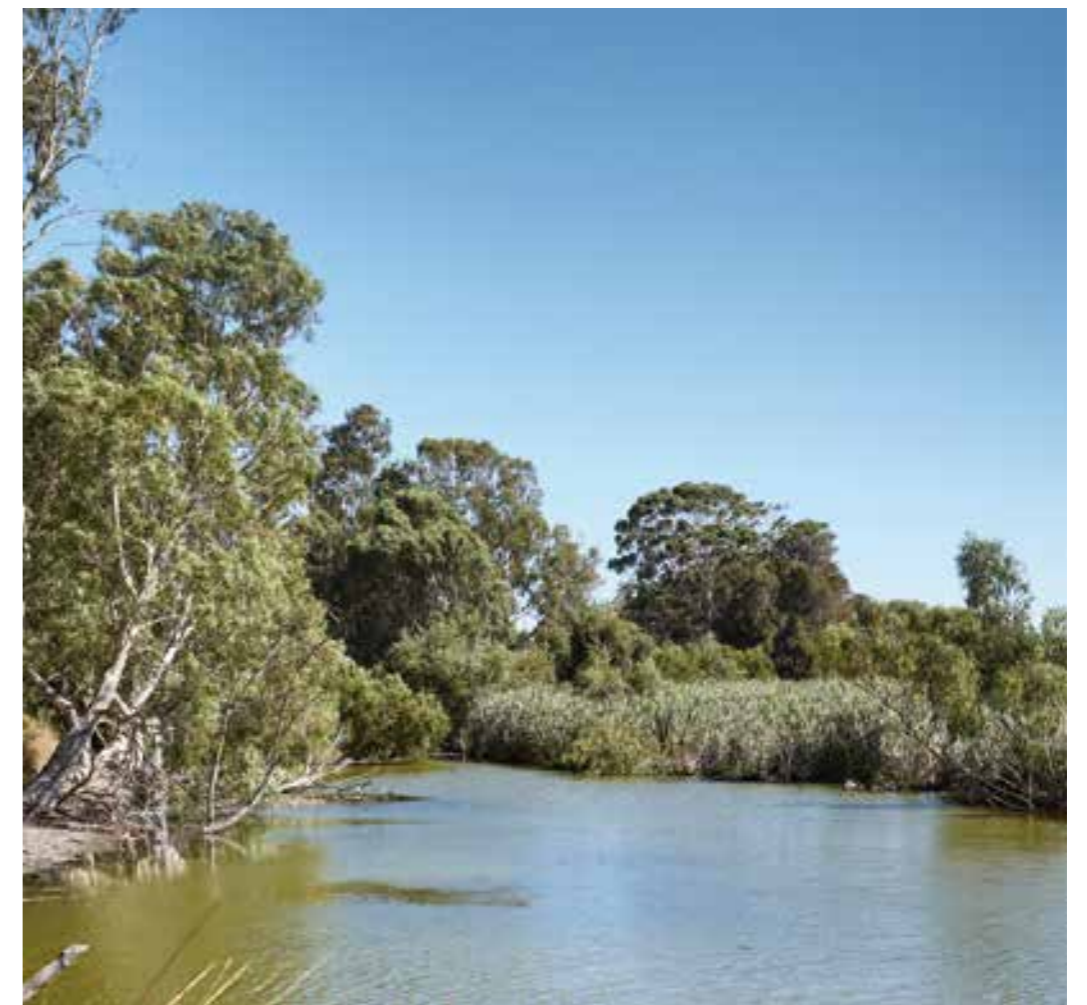
Herdsmen Lake. Jon Sanders Dr, Herdsmen WA 6017 - 250M