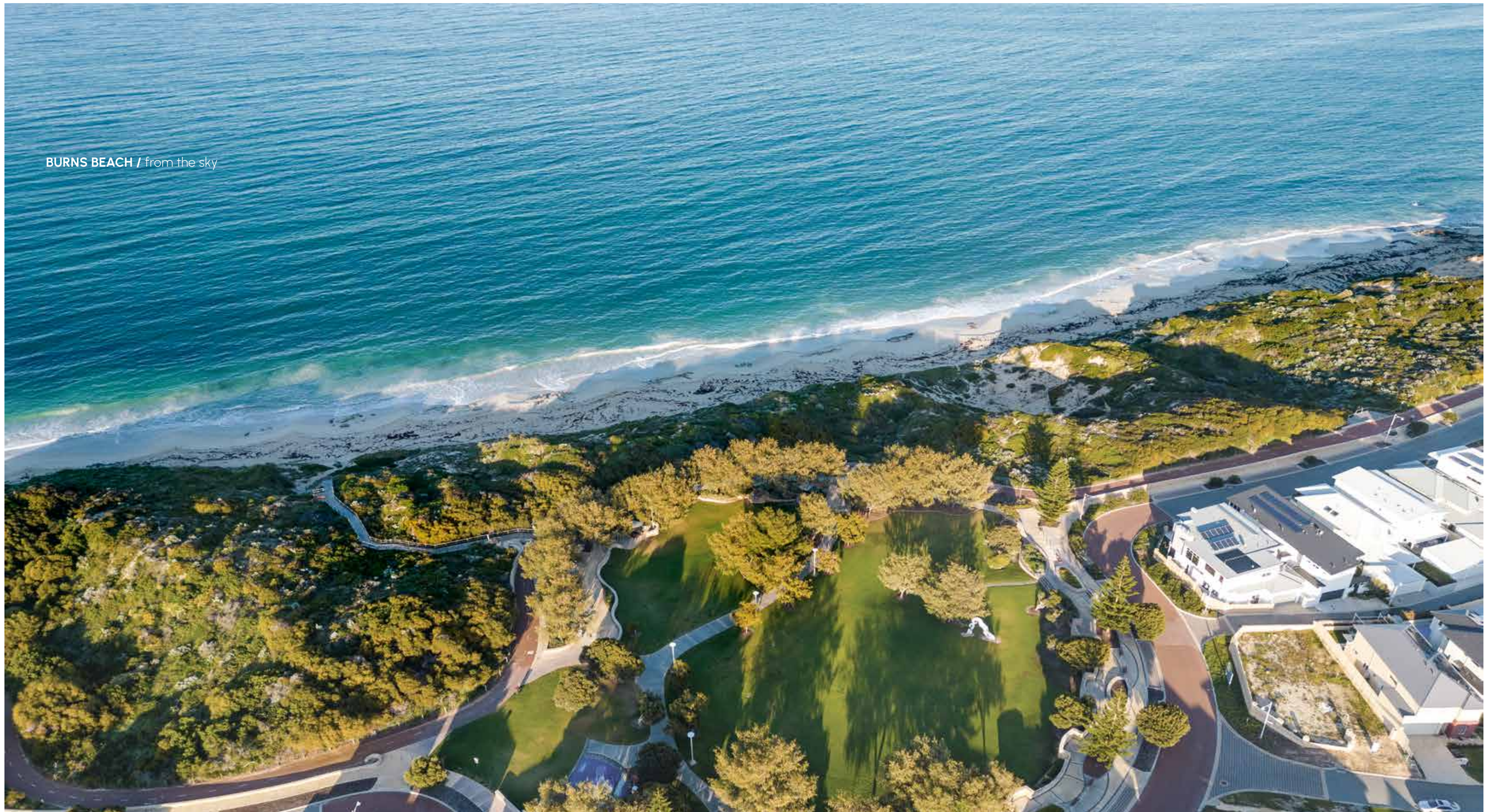
BURNS BEACH / from the sky