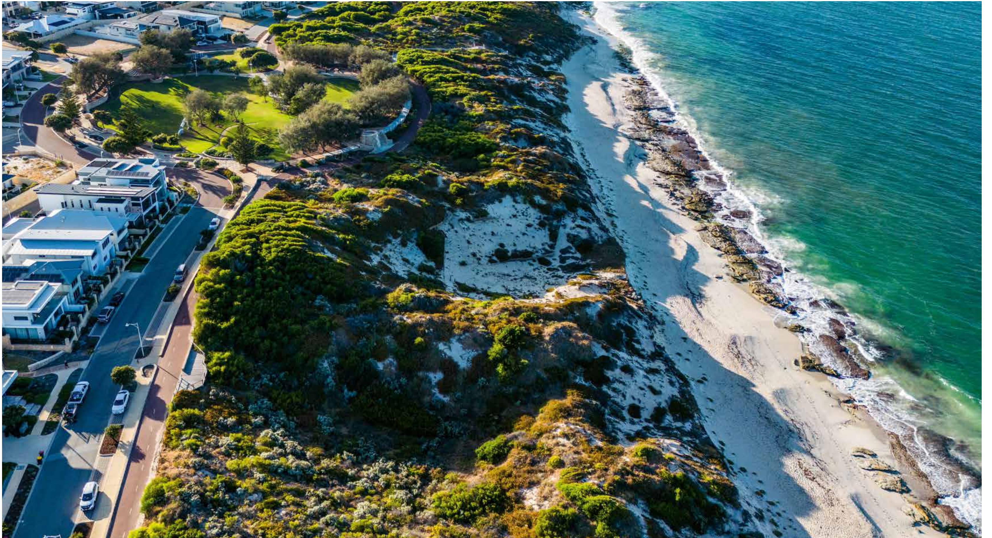
/ BURNS BEACH AT MIDDAY