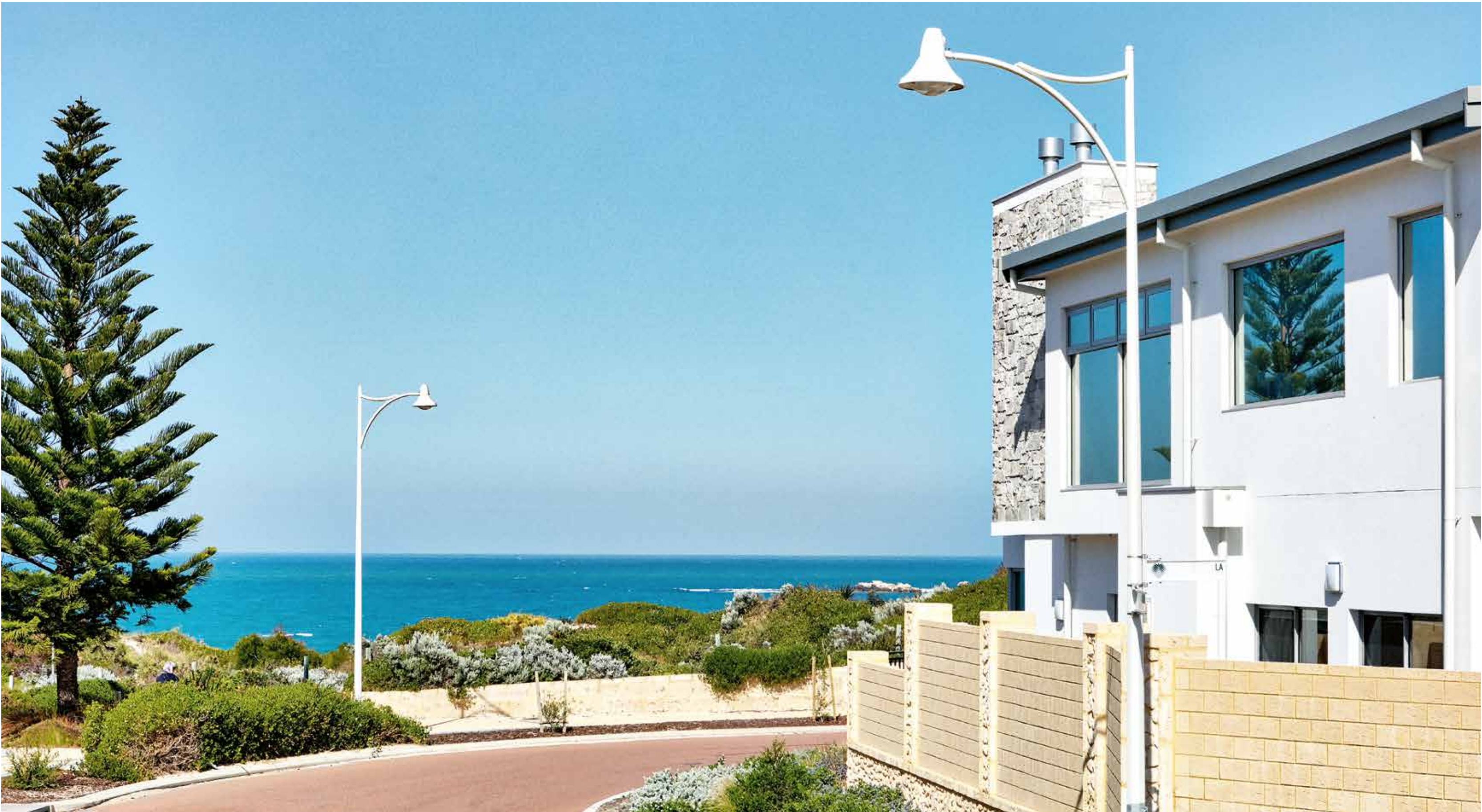
/ BURNS BEACH AT MIDDAY