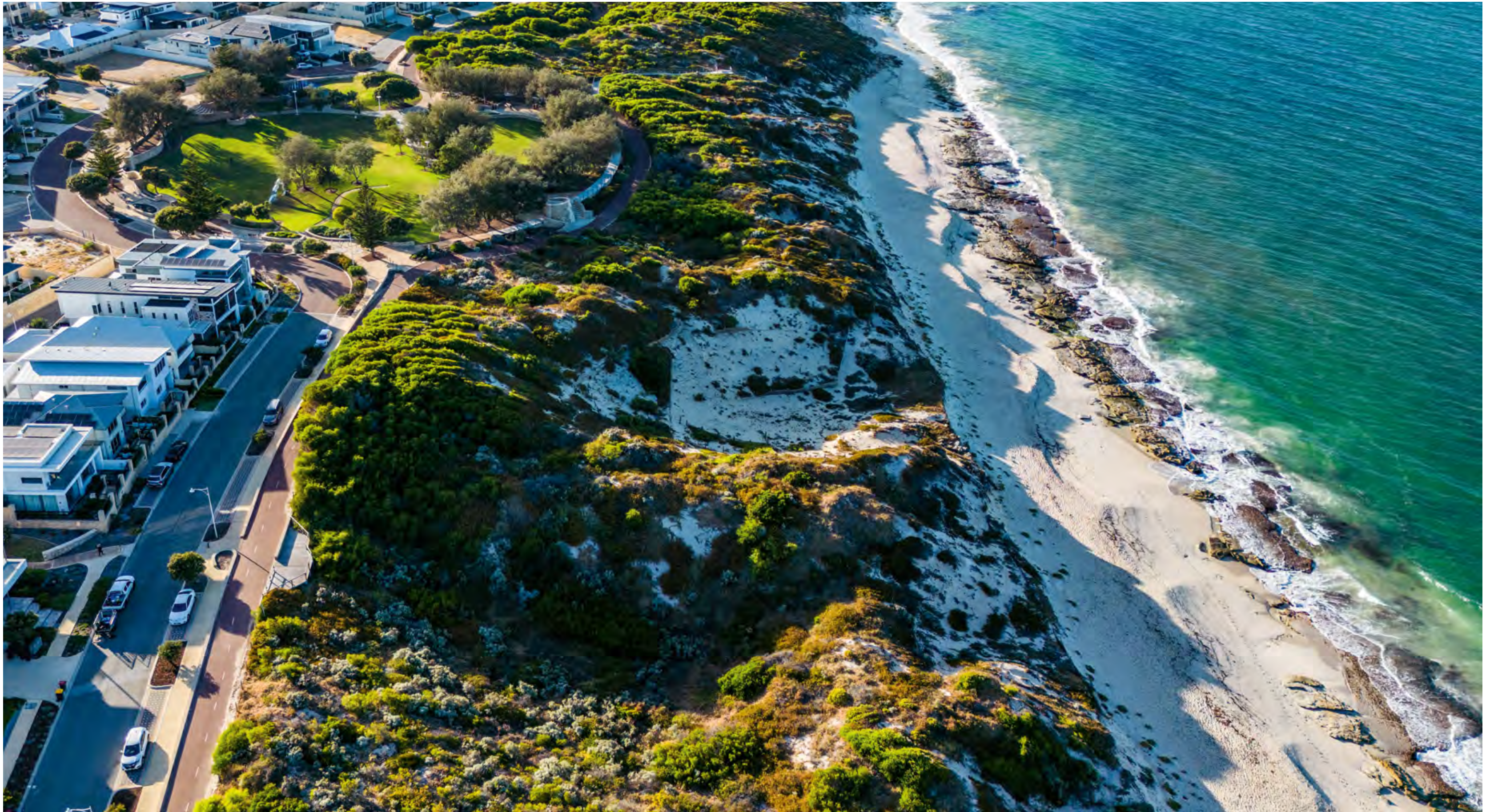
/ BURNS BEACH AT MIDDAY