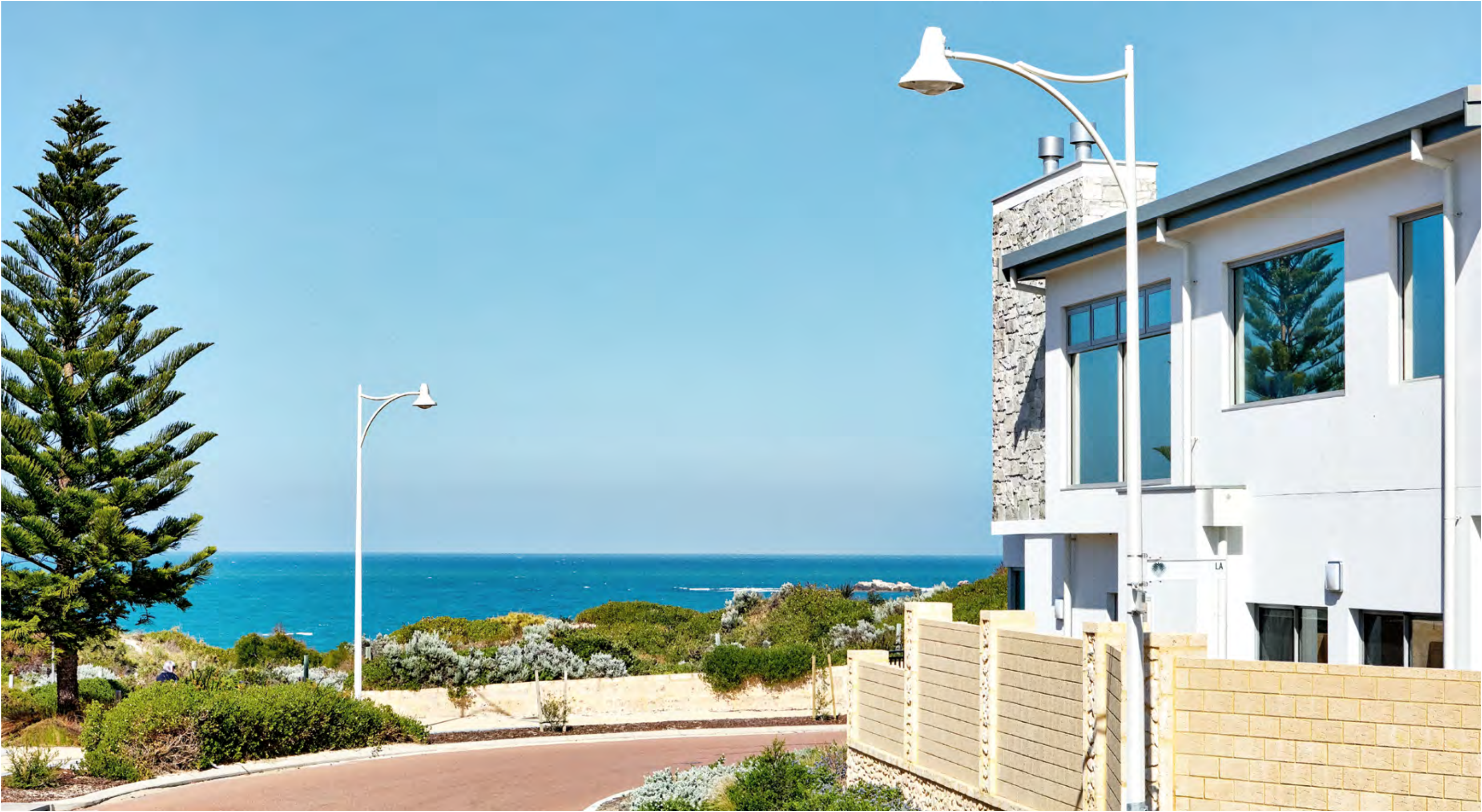
/ BURNS BEACH AT MIDDAY