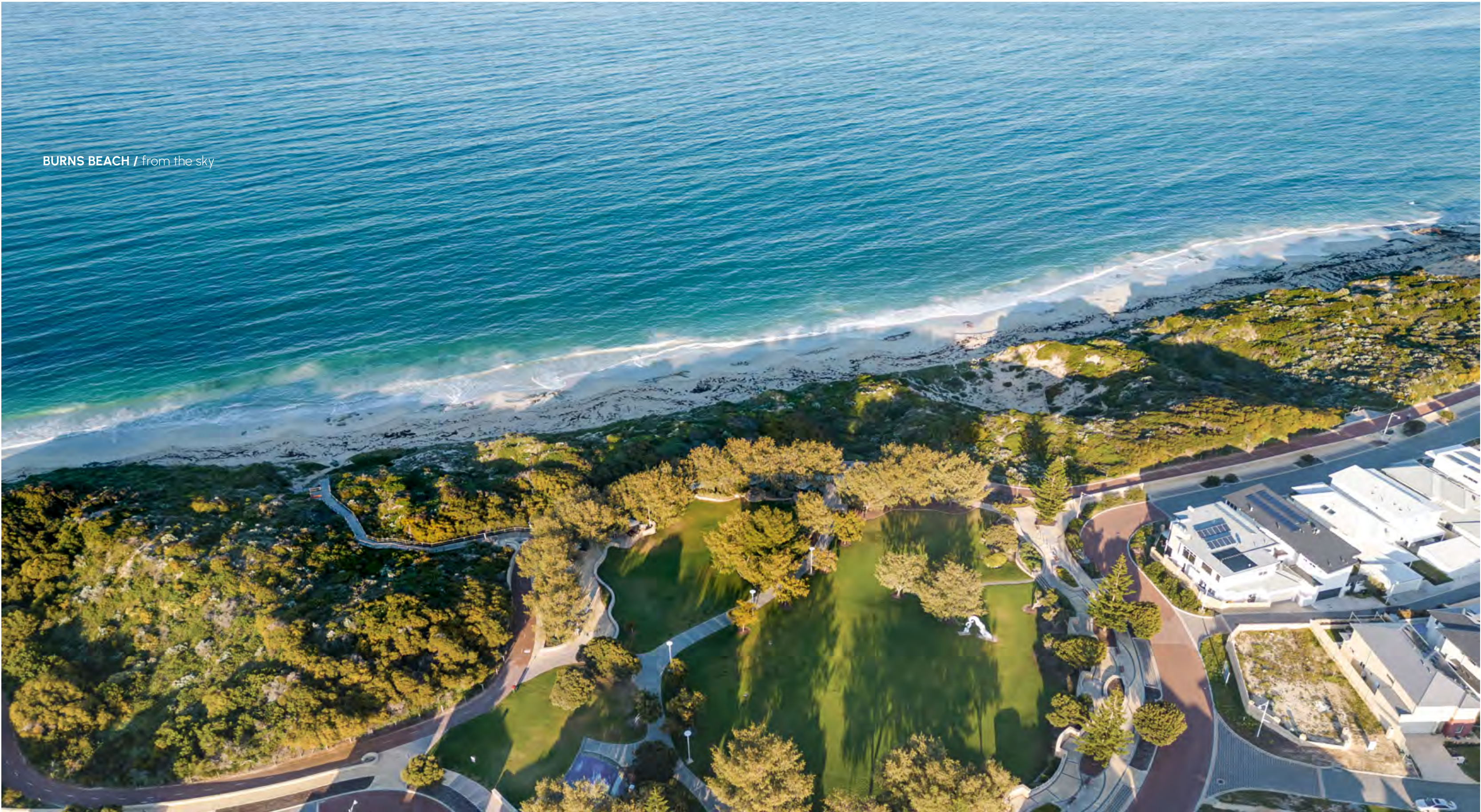
BURNS BEACH / from the sky