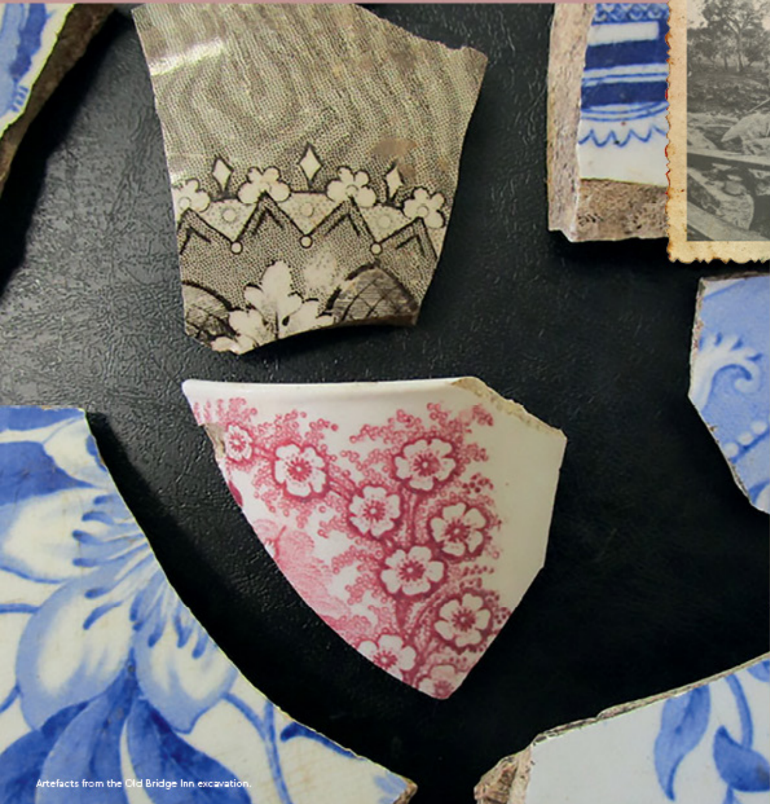
Artefacts from the Old Bridge Inn excavation.