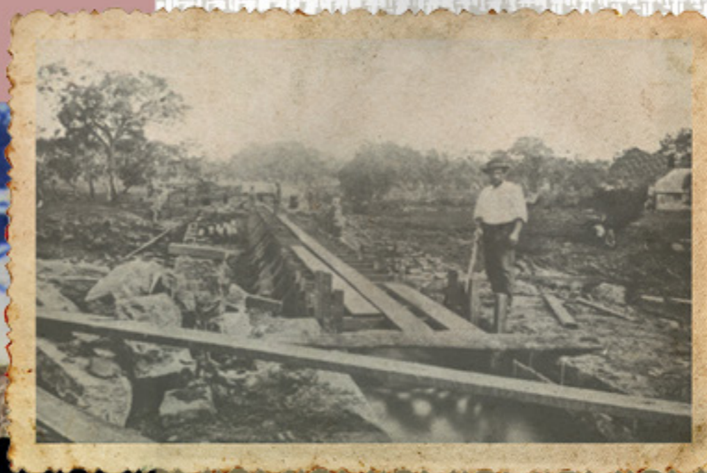
Yan Yean Aqueduct 1878, mill cottage in background.