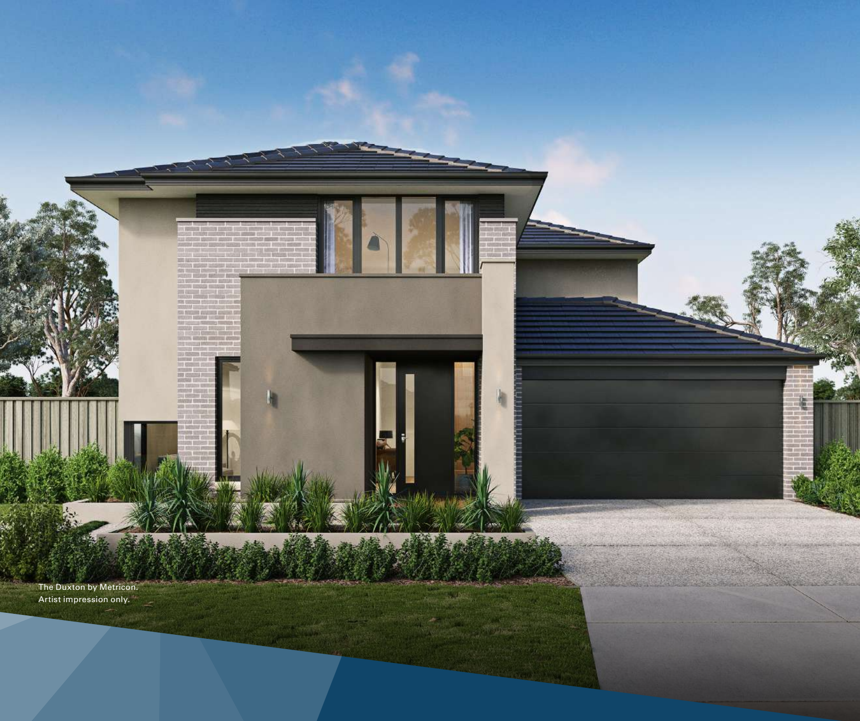
The Duxton by Metricon. Artist impression only.