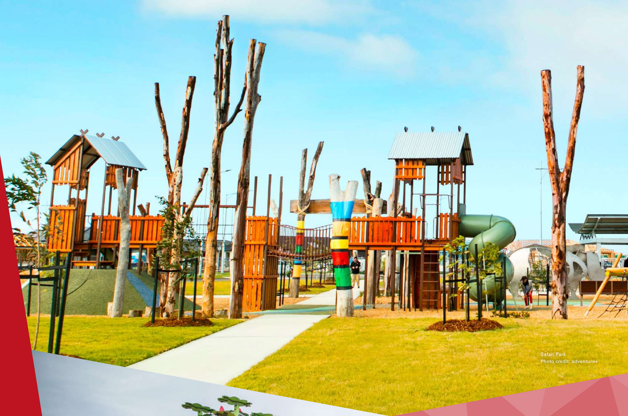
Safari Park