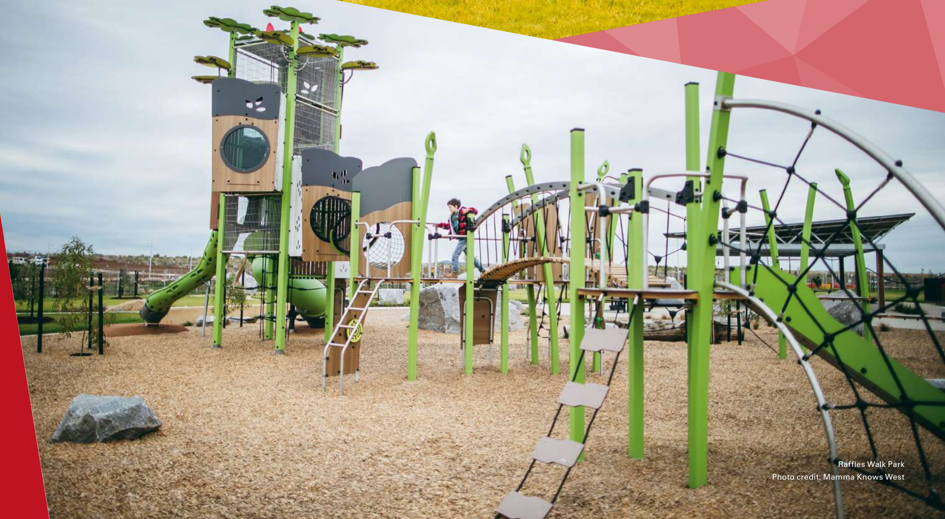
Raffles Walk Park