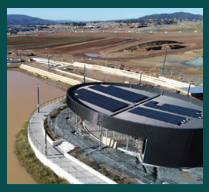
oldsymbol{\uparrow} Image: The Googong Sales Office and Bunyip Park hard landscaping are well underway.

Construction of Bunyip Park has ramped back up with the lake side decks and performance stage well underway. Completion is expected in the 3rd quarter of this year.