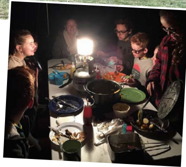
A healthy evening meal of hamburgers and vegies rounded out each day.

They also prepared their own meals – a hearty breakfast of bacon or sausage and eggs with cereal, a salad roll for lunch and hamburgers with potatoes, carrots and pumpkin for dinner.