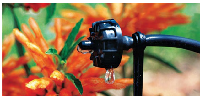
Drip irrigation can be directed onto the root zones of plants.