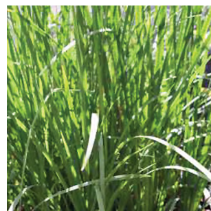
Use waterwise plants that do not require large amounts of water.