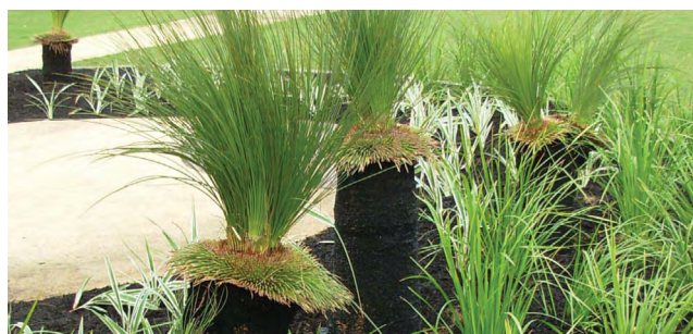
Apply mulch to garden beds to reduce evaporation from soil and minimise expanses of lawn.