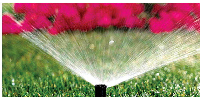
Spray irrigation evaporates quickly.