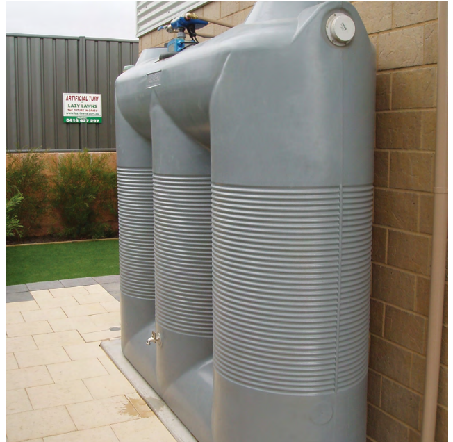
Example of a rainwater tank that you could have in your home.