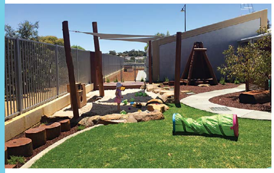
One of the new outdoor play areas at Wellard's Maragon Early Learning Centre.