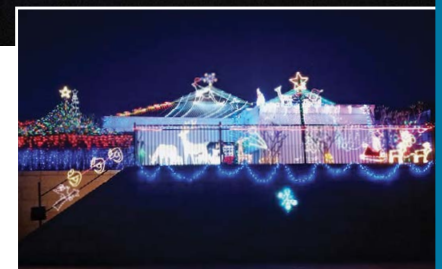
A very close second – the illuminated 6 Fareham Crescent.

It was right down to the wire determining the 2016 winner of The Village at Wellard Christmas Lights Competition.