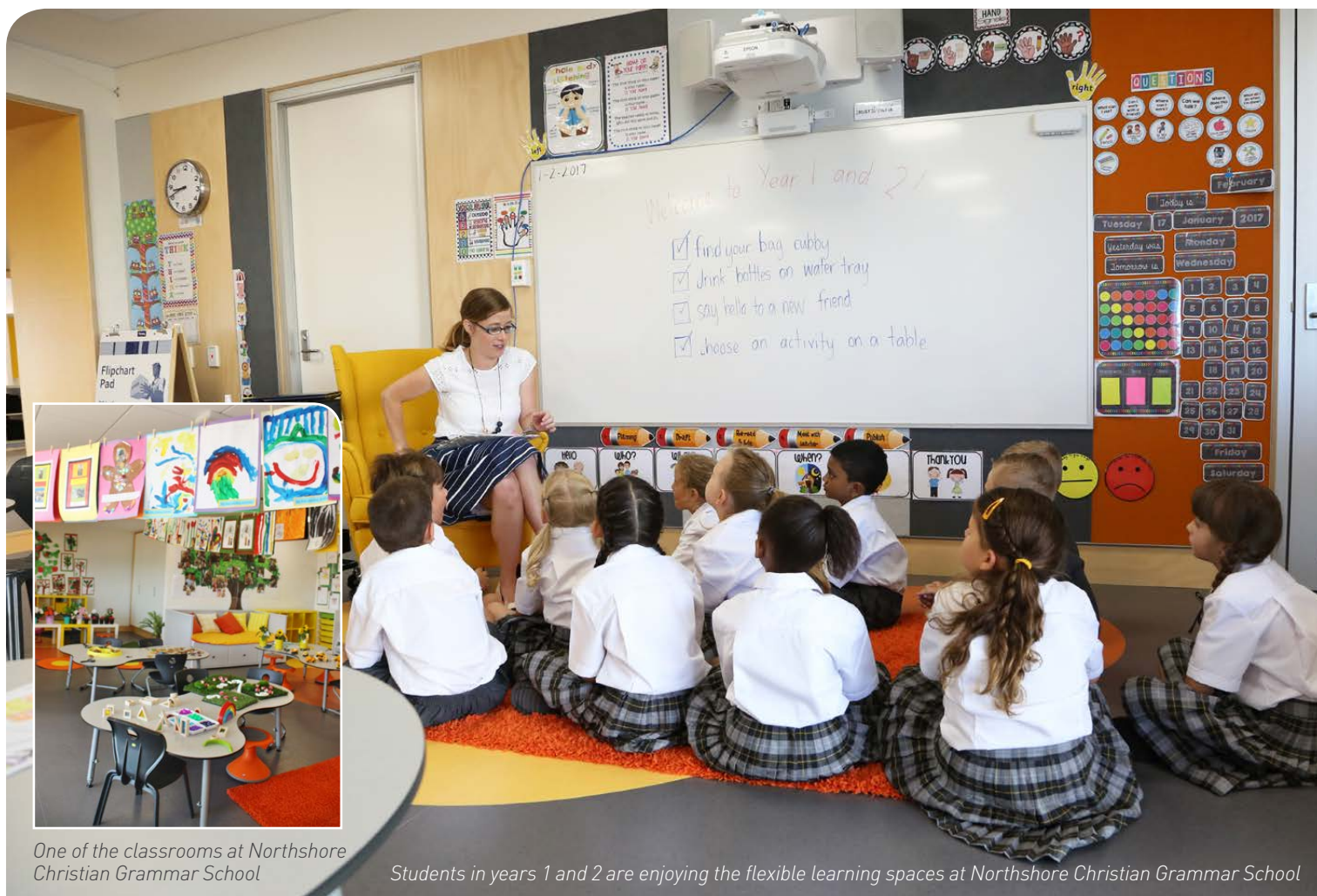
One of the classrooms at Northshore Christian Grammar School