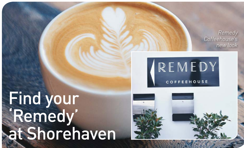
Remedy Coffeehouse's new look