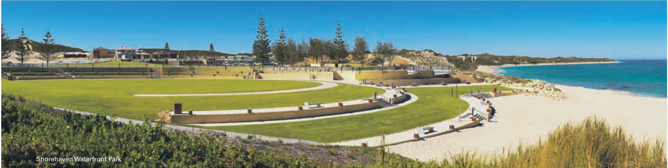
Shorehaven Waterfront Park