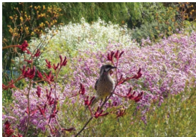
Native plants provide for native wildlife.

Avoid using fertiliser before heavy rainfall to prevent nutrient runoff or leaching of nutrients into the groundwater. More information on safe fertiliser use can be found on the Water Corporation website ( watercorporation.com.au ) or the Department of Agriculture and Food website ( agric.wa.gov.au ).