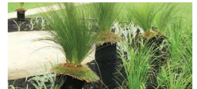
Apply mulch to garden beds to reduce evaporation from soil and minimise expanses of lawn.