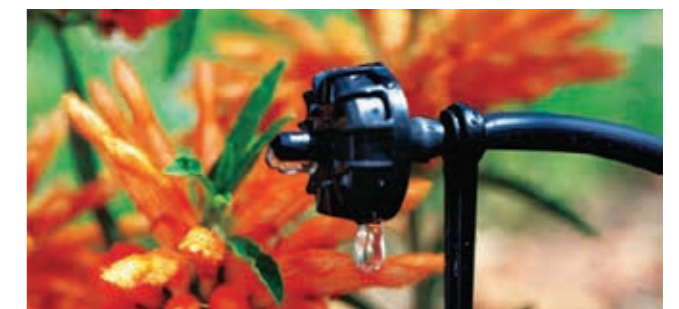
Drip irrigation can be directed onto the root zones of plants.