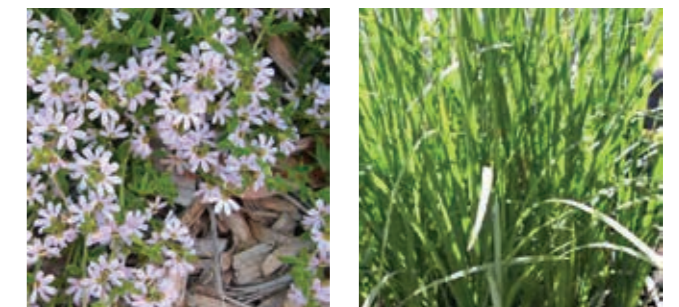
Use waterwise plants that do not require large amounts of water.