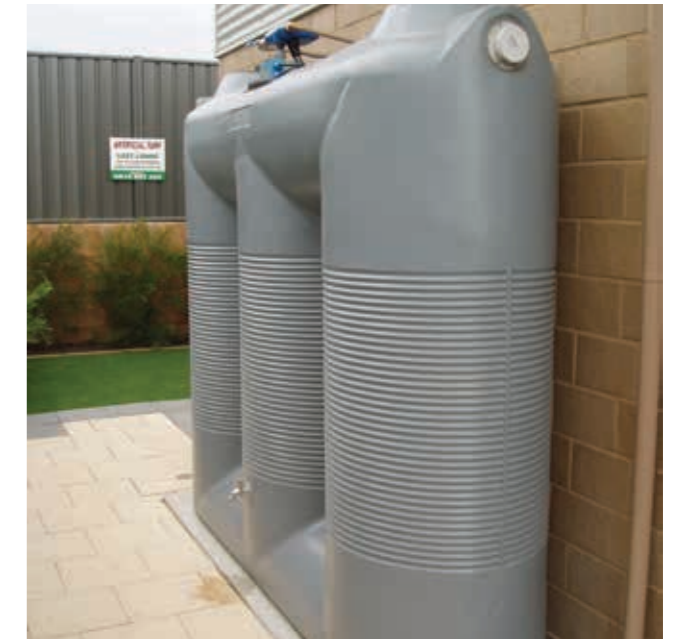
Example of a rainwater tank that you could have in your home.