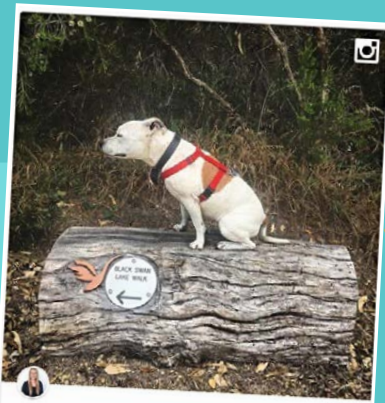
LITTLEBOXESOFIFE This Way 🐾 #theamazingpuzzledog