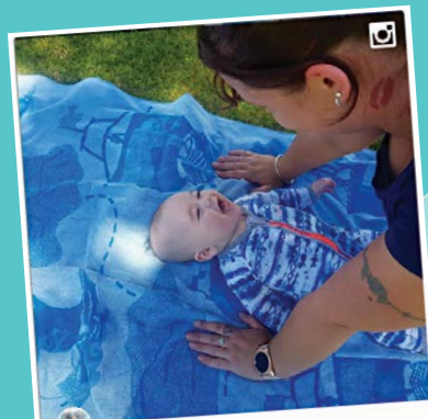
BE FREE, HEALTH AND FITNESS Enjoying push ups in mums and bubs class today