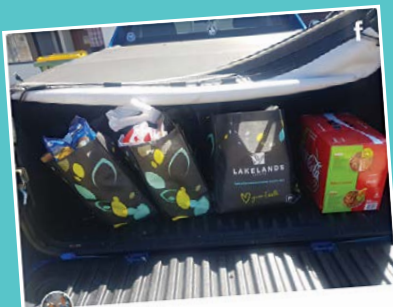
TRISH KARALITI Rockin' our Lakelands Estate shopping bags today... Thanks Raelyn 😊😊

We love seeing your happy snaps at Lakelands and encourage you to post these on social media using the #lakelandslife hashtag!