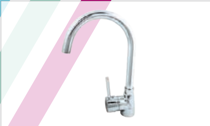
Kitchen Sink Mixer