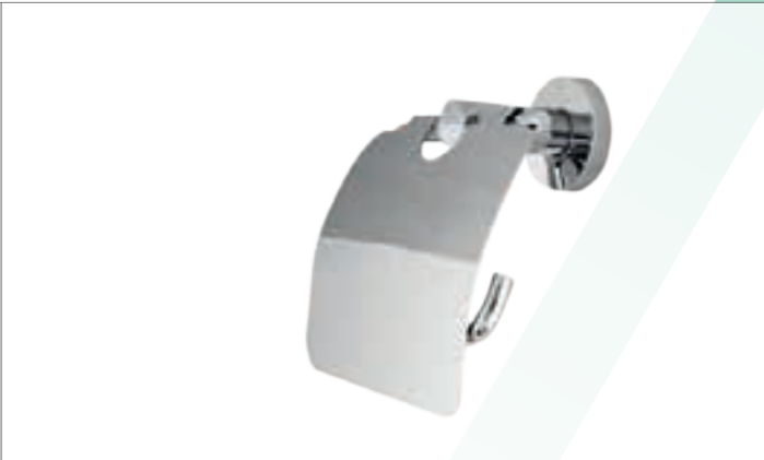
Toilet Roll Holder