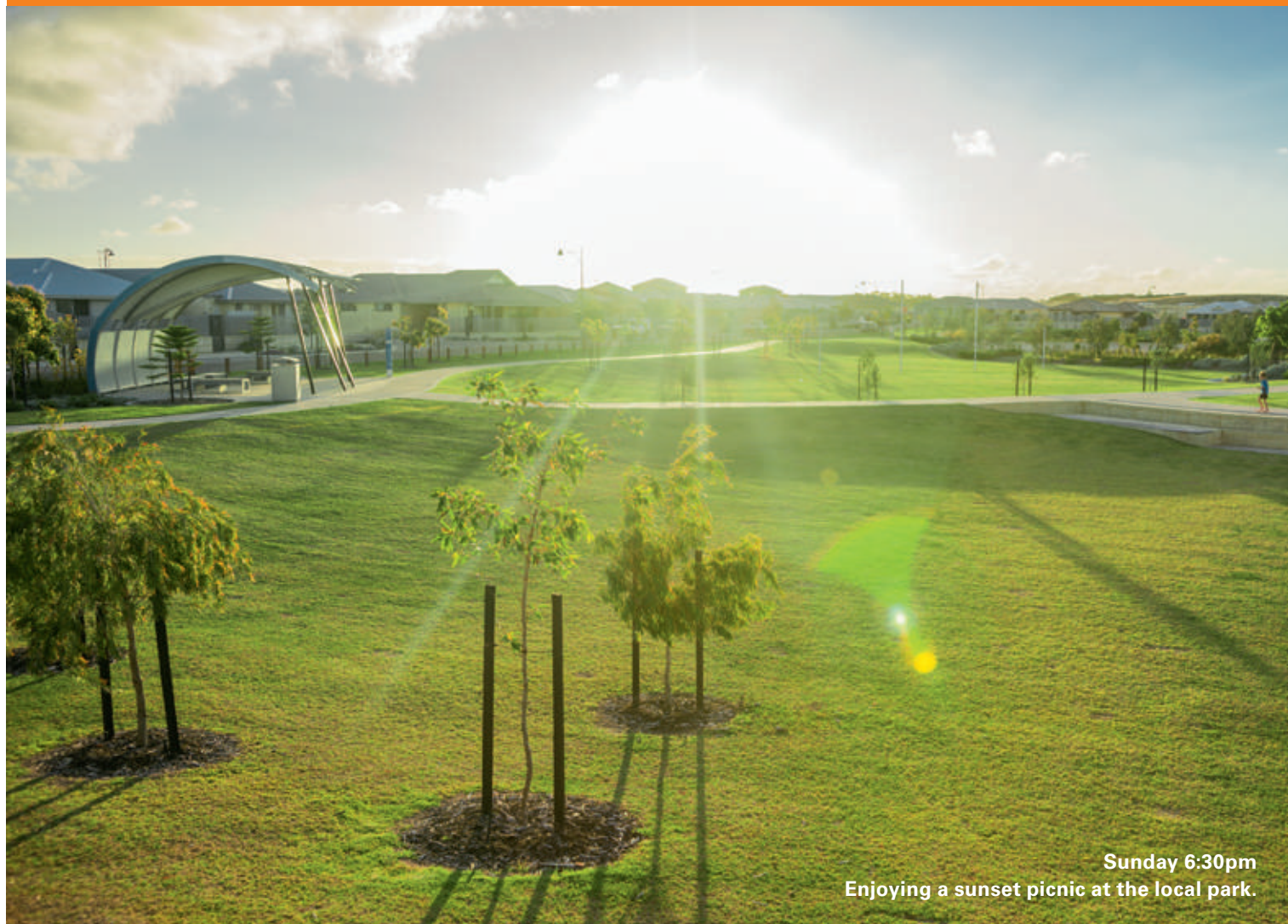
Sunday 6:30pm Enjoying a sunset picnic at the local park.