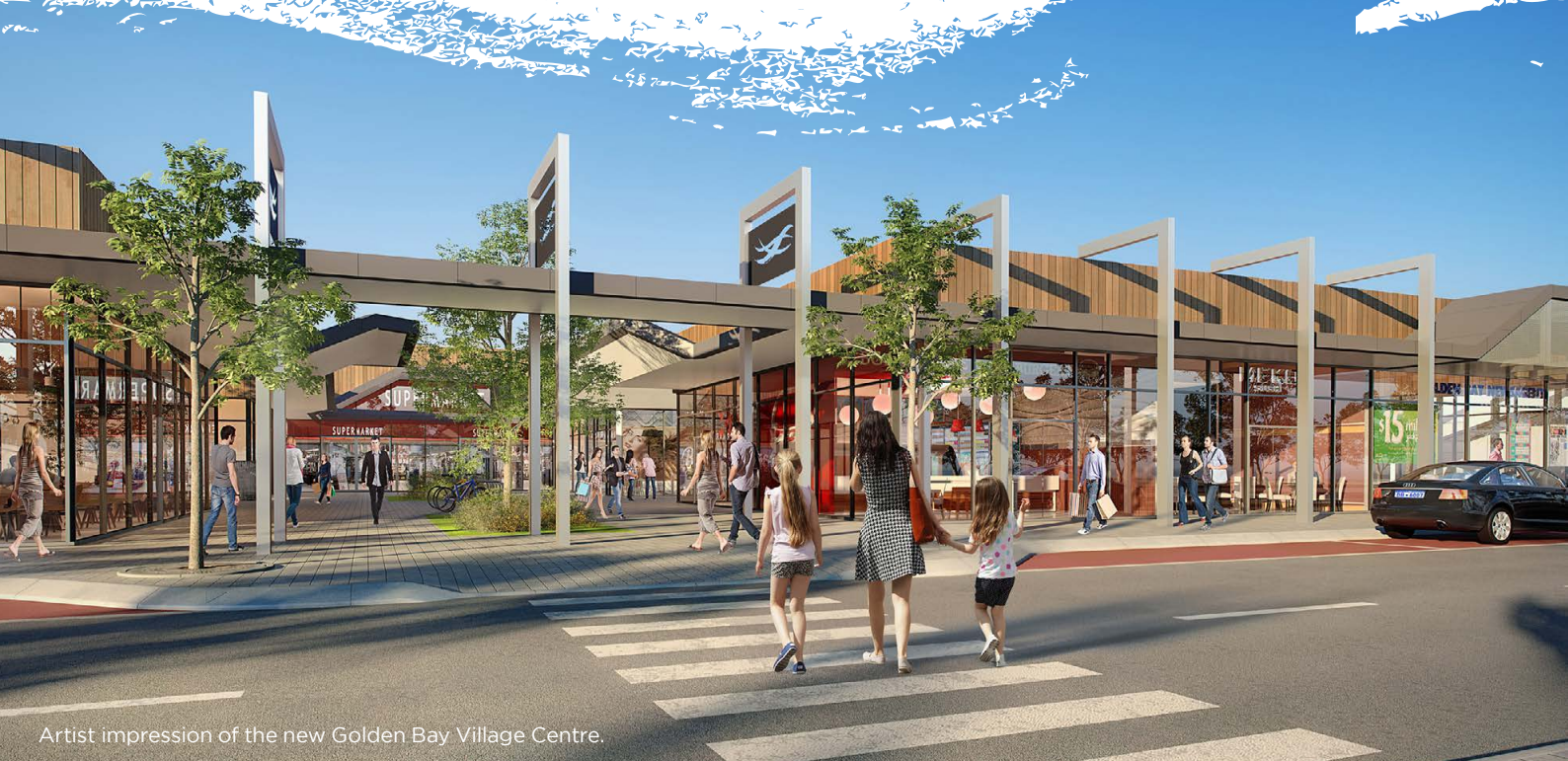
Artist impression of the new Golden Bay Village Centre.