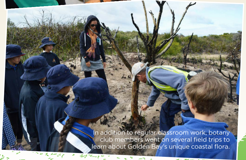
In addition to regular classroom work, botany club members went on several field trips to learn about Golden Bay's unique coastal flora.