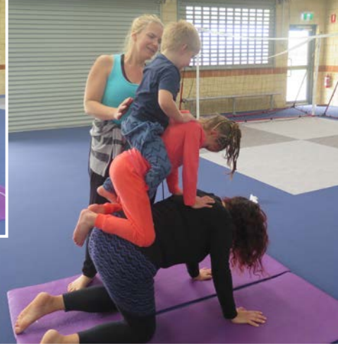
Building inner balance...