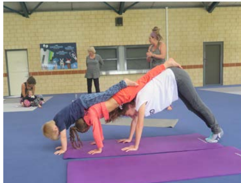
'Downward dog', stacks-on-the-mill style - lots of fun for budding yogis

Our other Get Together events included a 'over coffee' catch up, casual sundowner and photography workshop and it was fantastic to see community members meeting and becoming friends. We look forward to seeing you at our next event at Sunset Hill Park, Aurea Boulevard for a Sundowner on 13 November.