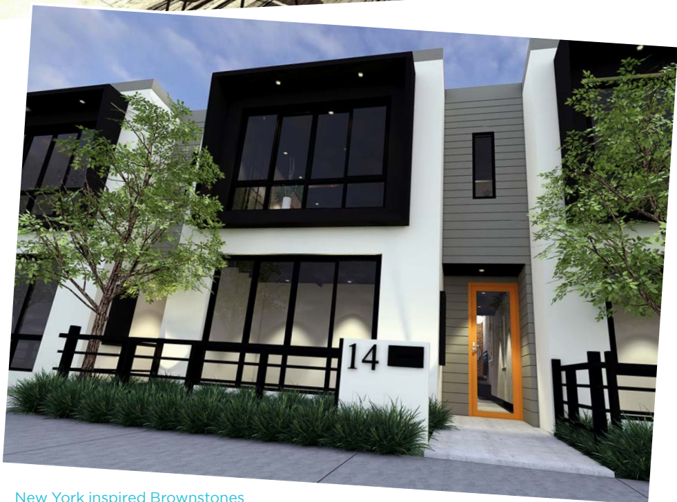
New York inspired Brownstones – a first for WA – coming to Golden Bay.