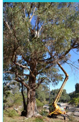
Breeding box installation underway at Paganoni Swamp.

"So many Golden Bay and Singleton residents like to walk through the reserve and have a real connection with Paganoni Swamp. It's fantastic that we are able to partner with Golden Bay to enhance and preserve the natural local environment.