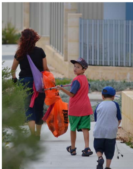
Golden Bay residents out and about cleaning up local streets.