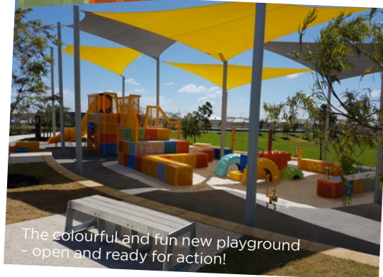
The colourful and fun new playground – open and ready for action!

The new park is just one of the many attractive public open spaces within Golden Bay estate which include ample recreational lawn areas, state-of-the-art play equipment and nature play areas, viewing decks, BBQ facilities, seating and walking paths.