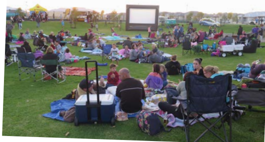
Golden Bay locals gathered for a great night out under the stars, taking in the movie and catching up with the Easter Bunny.