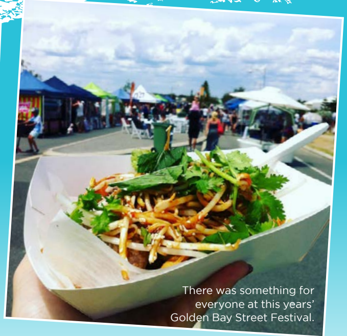
There was something for everyone at this year's Golden Bay Street Festival.