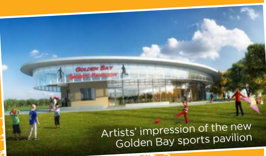
Artists' impression of the new Golden Bay sports pavilion