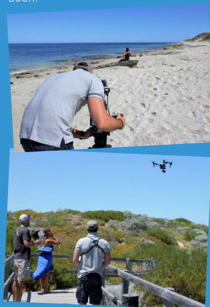
The camera crew and their aerial drone in action

We look forward to sharing it online soon!