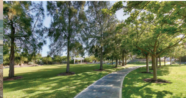
Central Park, Burns Beach Estate