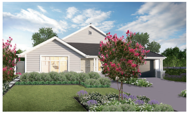
Artist impression only. Vancouver by Porter Davis.

There are three contemporary garden designs for you to choose from. Each has been created with the goal of enhancing both your home and the surrounding environment.