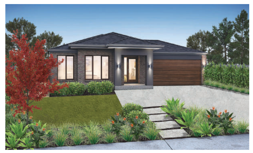
Artist impression only. Lamont by Porter Davis.