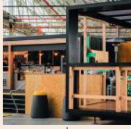
THREE LITTLE PODS