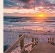
ADELAIDE'S BEST BEACHES