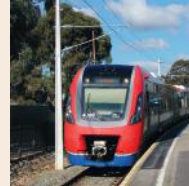
TONSLEY TRAIN STATION