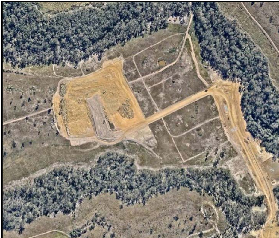
Picture 1: Aerial View of the Site 17/05/2016

The Site is bounded by future residential developments to the East, and undeveloped land to the North, South and West.