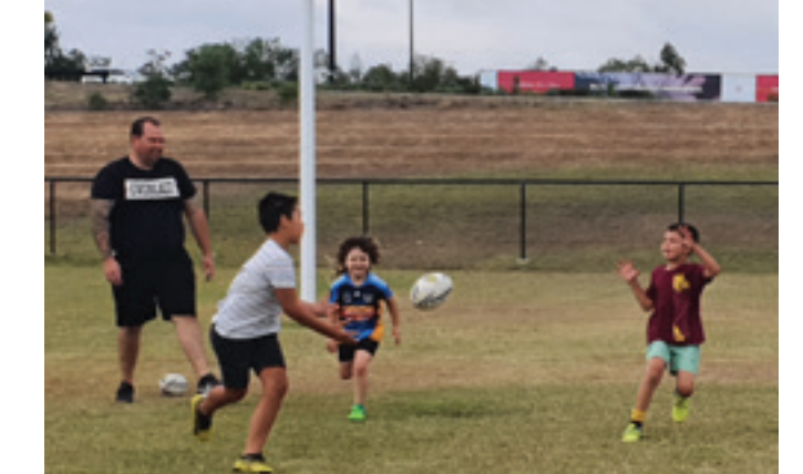
Flagstone Tigers are having an Open Day on Saturday 19 December, 3pm – 6pm at Flagstone Oval, Flagstonian Drive, Flagstone.

For further information visit @flagstonetigers or follow the QR Code to the relevant site.