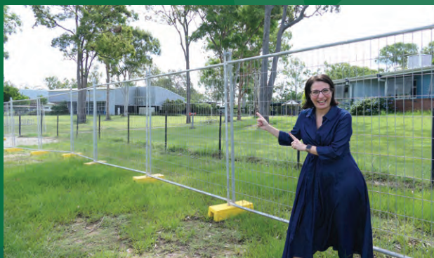
Inspecting Flagstone State Community College security fencing progress.