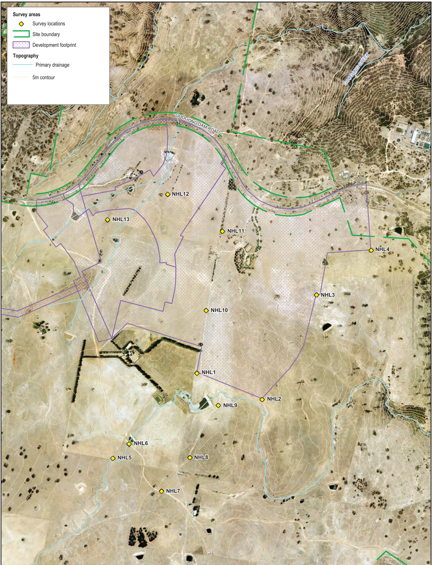
Figure 10: Flora survey locations - Neighbourhood 1 Development area