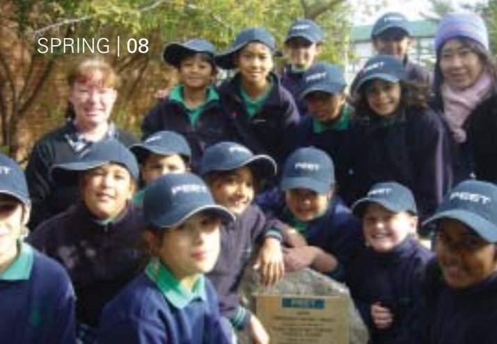
Waterwise students from Good Samaritan Catholic Primary School, Roxburgh Park VIC.